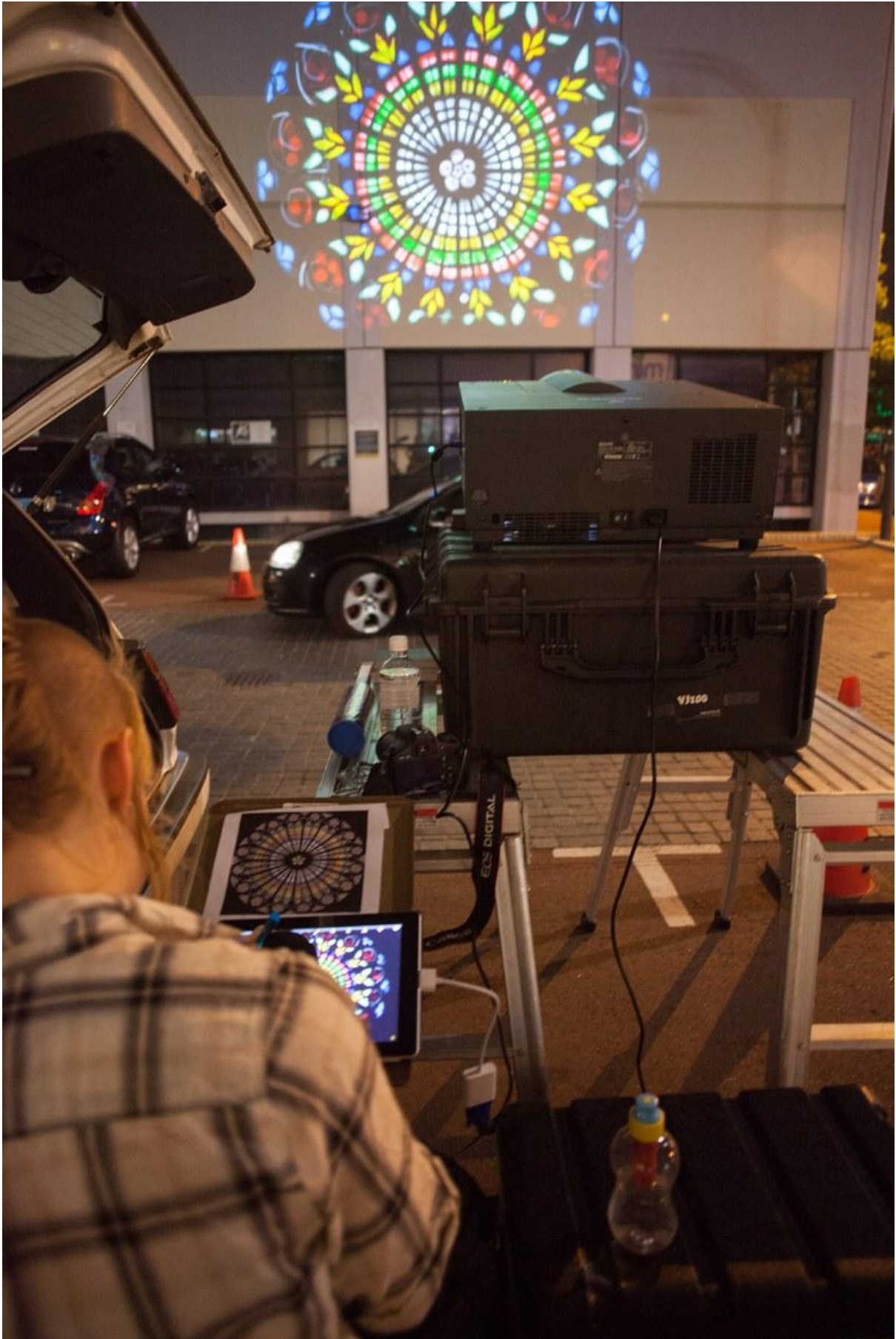
Image 4. Jenna Downing live drawing with an iPad and the VJzoo projection set-up.