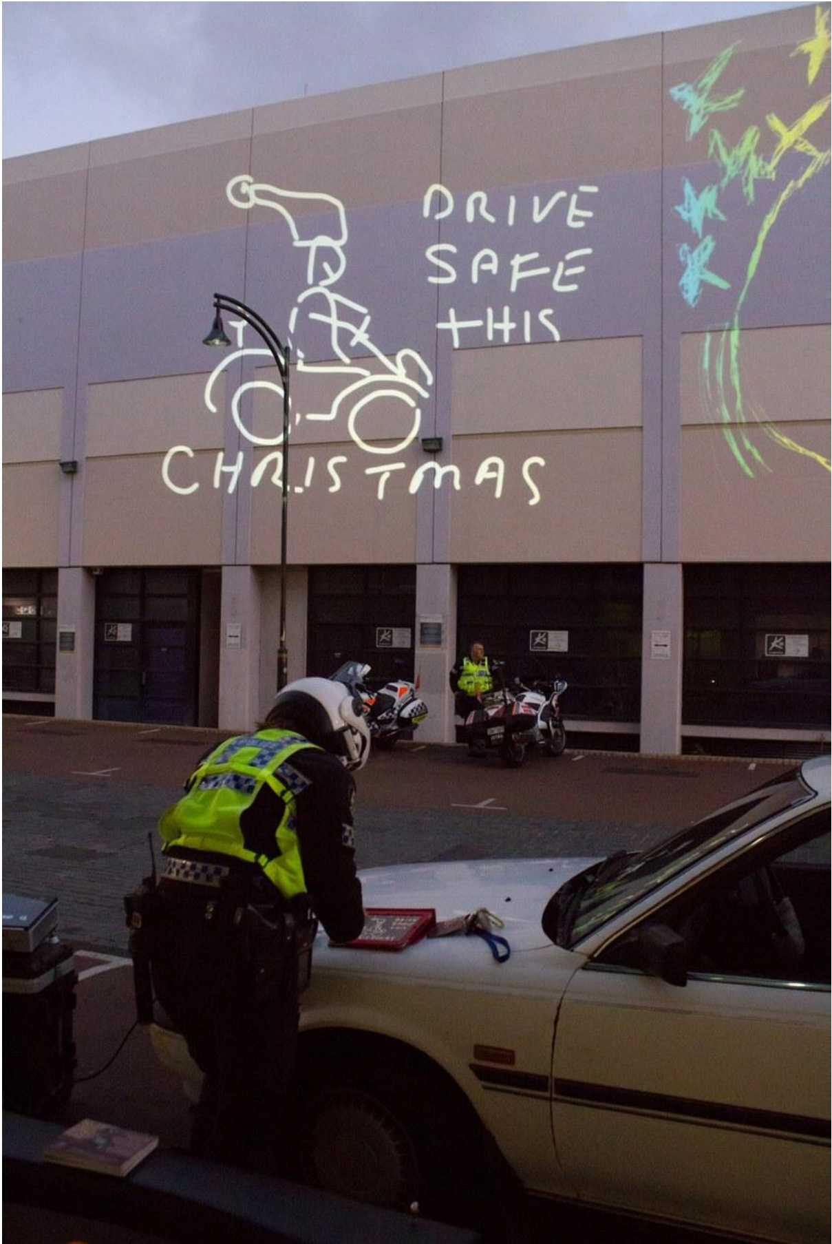
Image 5. The local police creating art to inspire a little safe driving during the holiday season.